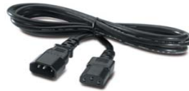
IEC 250 Volt Power Cord/Plug

tions and Safety documentation necessary. All our 240 volt units until recently have used 240 volt IEC style receptacles/cords and