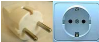
German 240 Volt Plug/Receptacle

I assume some customers are simply unaware of the risks and some manufactures assume that they will not be held accountable if things go wrong?