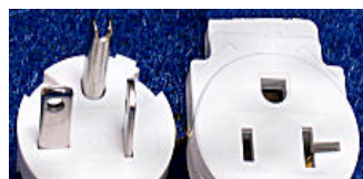
North American 120 Volt 20 Amp

In North America the power in most homes is 120 Volt 15 amps per circuit. If you wish with special wiring you can have 20 amp 120 volt circuits but they required different receptacles and plugs with different pin configuration.