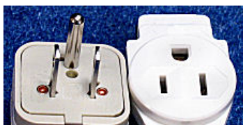
North American 120 Volt 15 Amp

THERE APPEARS TO BE A LOT OF MISUNDERSTANDING REGARDING THE TYPE OF APPROVED CERTIFIED POWER RECEPTICLES AND POWER CORDS THAT ARE ELECTRICALLY PERMITTED FOR USE AROUND THE WORLD WITH POWER CONDITIONING PRODUCTS SUCH AS TORUS