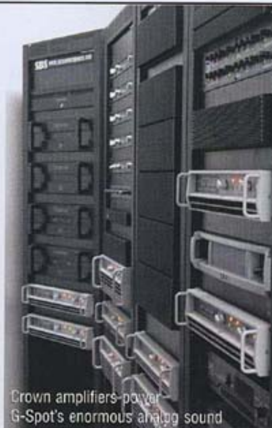
Crown amplifiers power G-Spot's enormous analog sound

"I chose to design the secondary room this way so that clients can